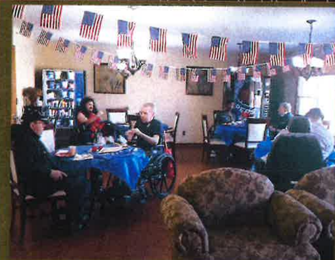
Veteran's Day Celebration!